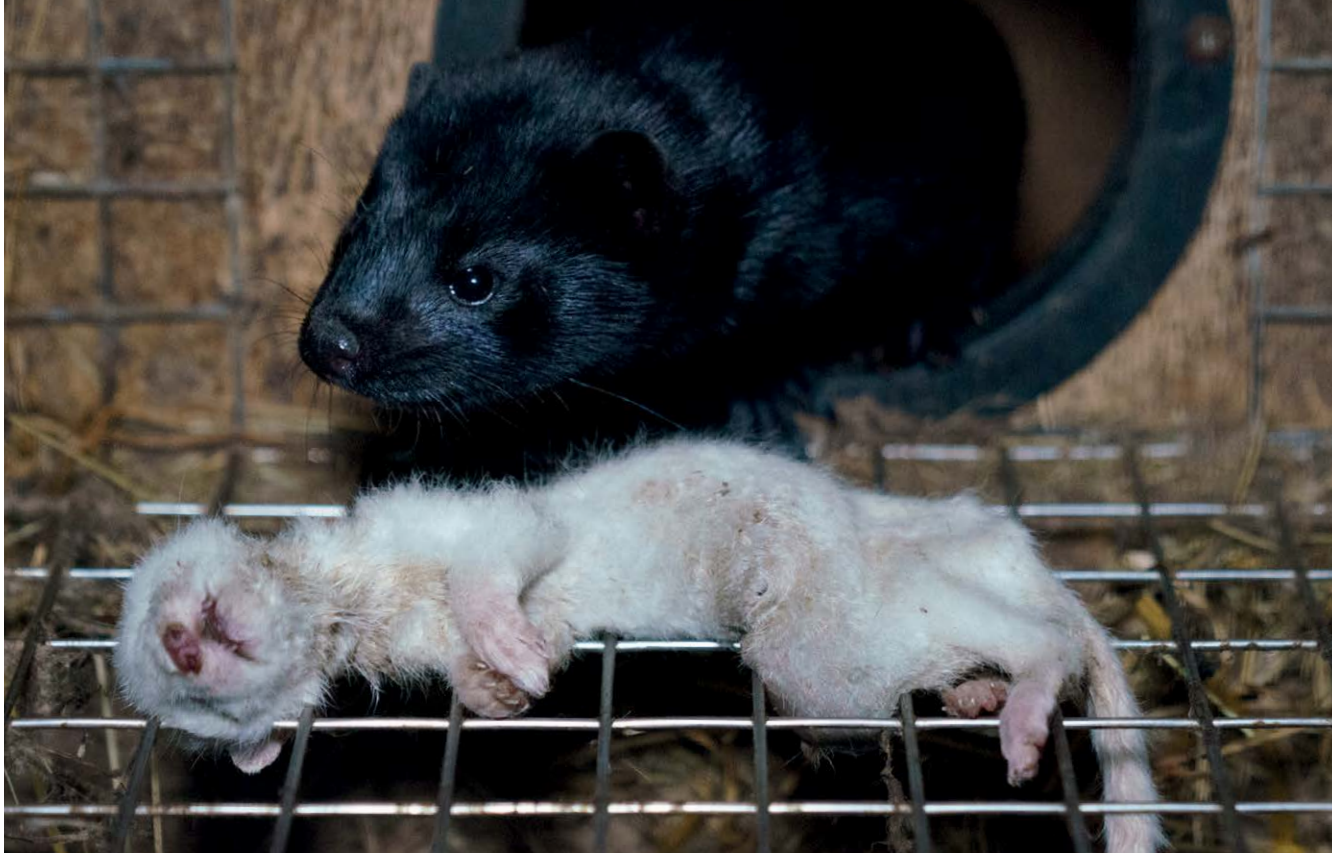
LEFT TO RIGHT: JO-ANNE MCARTHUR, SPCA MONTREAL; KRISTO MUURIMAA, OIKEUTTA ELÄIMILLE

In addition to examples of lack of independence within certification schemes that form part of Furmark, there also appears to be no substantive plan for Furmark as a whole to verify compliance within the schemes it gives its marketing name to.